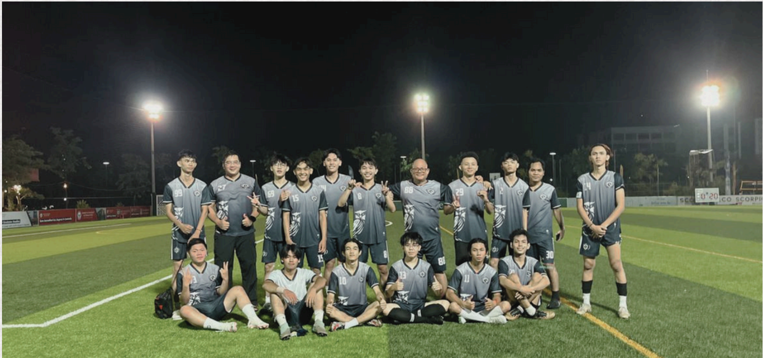
UTE Soccer Club

Whether you're a seasoned player or a newcomer to the sport, UTE's football club welcomes all students who value energy, enthusiasm, and community spirit. Join us every Friday to kick off your weekend on a high note!