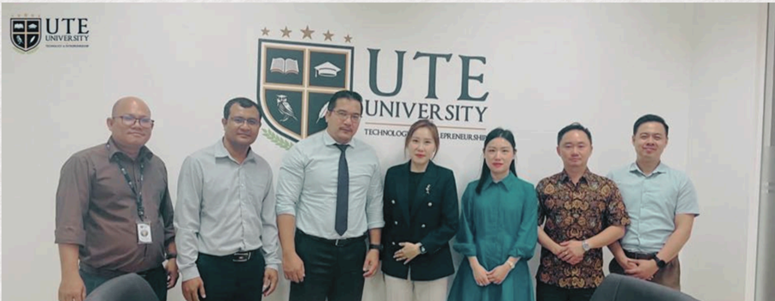
Photo With Representative from ICMS

Earlier in the month, on 4 June, we sat down with leaders and representatives from the International College of Management, Sydney (Australia), and Kurmul International School to discuss how we can work together in the future.