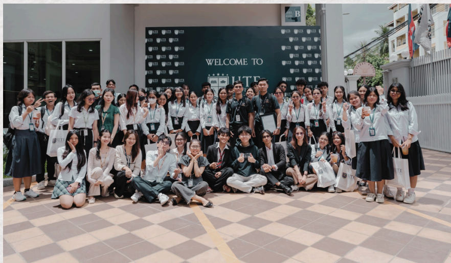
Students from NGS Prek Leap