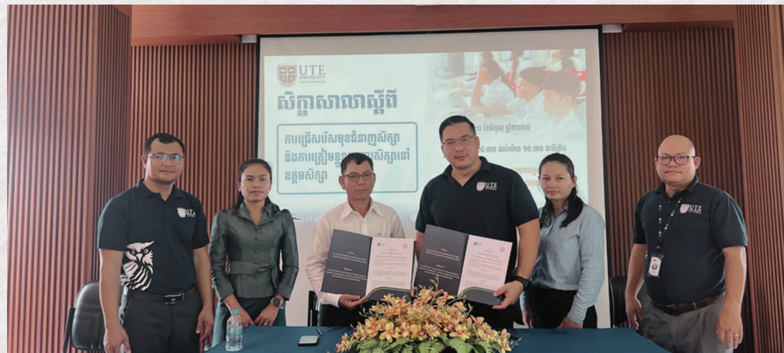
MoU Signed with Chea Sim Prek Anchanh (NGS)

A week later, on 20 June, our outreach team visited Samdech Akka Moha Dhamma Pothisal Chea Sim Prek Anchanh High School (NGS), where hundreds of students joined an engaging session on how to prepare for higher education. The students showed great curiosity and energy, asking thoughtful questions about university readiness, campus life, and program selection.