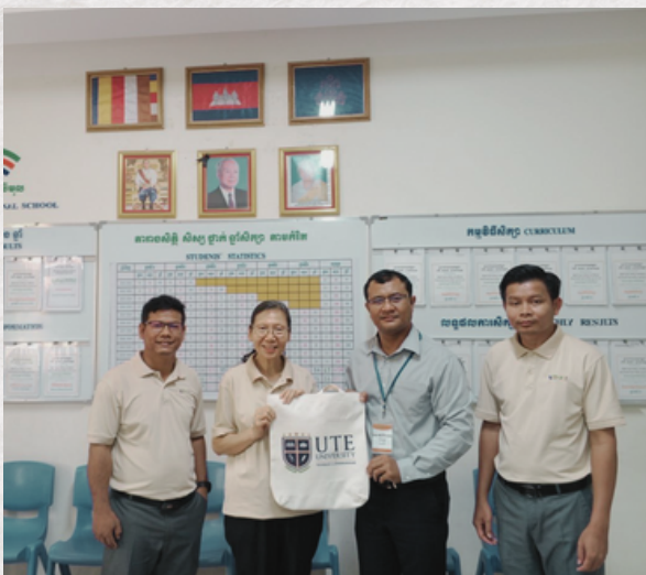
Photo with the Principal of Kurmul International School

From co-hosting student engagement activities to offering pathways for Grade 12 students, the meetings were full of potential. Kurmul International School was especially open to welcoming UTE for future outreach events, something we're very excited about.