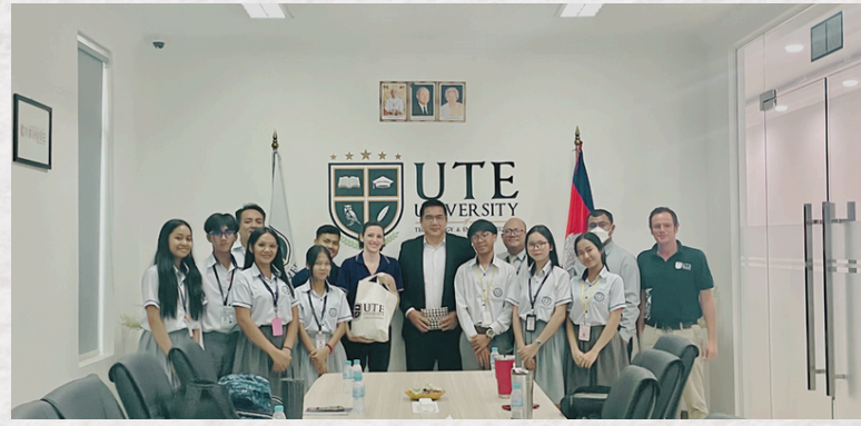
MoU Signed and Gift Exchanged with ACT