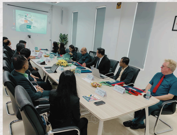
MoU Signed with NIC Group