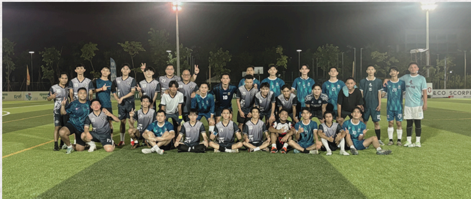
UTE Soccer Club and Friendly Match

Every Friday evening, UTE students gather on the field for football training and friendly matches. The UTE Soccer Club is not just a space for sport; it's a platform for team building, physical fitness, stress relief, and leadership development.